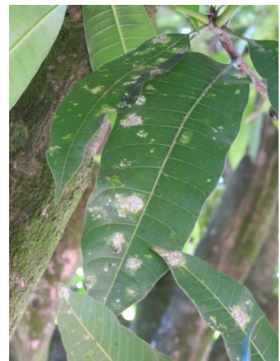
Symptoms of mango disease on trees in Lelisa Dimtu kebele

They are struggling to grow new fruit trees (both mango and oranges) due to problems with termites which destroy the young seedlings. All the fruit trees they have are now old, which may be a cause of the disease. Banana and coffee have both been recently introduced to the kebele but both are being affected by disease which has resulted in declining productivity.